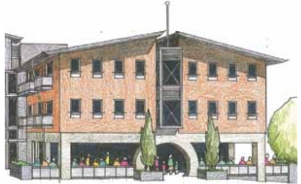
Proposed accommodation block beside campus

This small but rapidly expanding campus allows great promise for those interested in the hotel and tourism industry. Programmes being presented here include: business, tourism, beauty therapy, information technology, personal training, and high performance sport (tennis and golf).